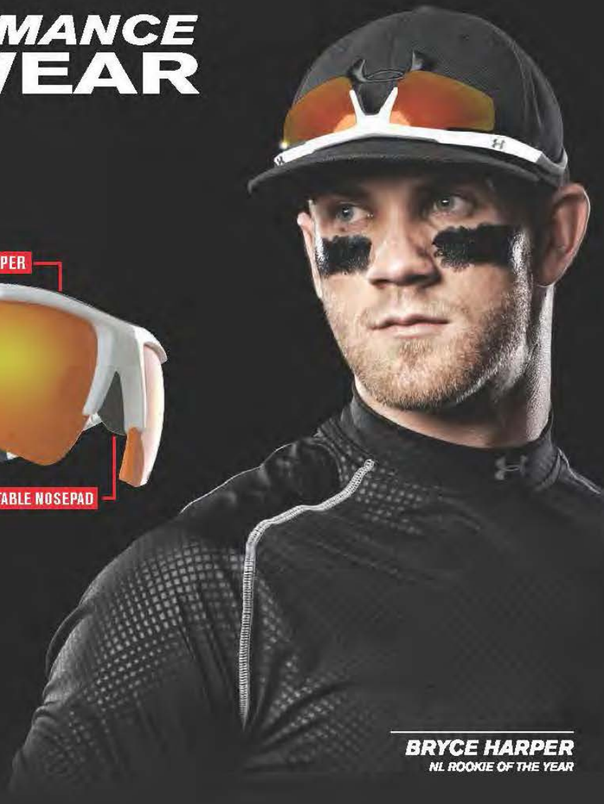
BRYCE HARPER NL ROOKIE OF THE YEAR

ARMOURFUSION™ Ultra-lightweight, impact-resistant sunglass frames.